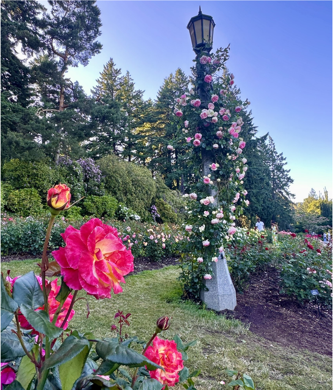
Our St. Paul June 2024