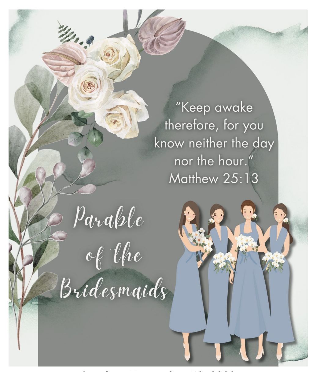
Sunday, November 12, 2023

"No matter who you are, No matter where you are on life's journey, You are welcome here."