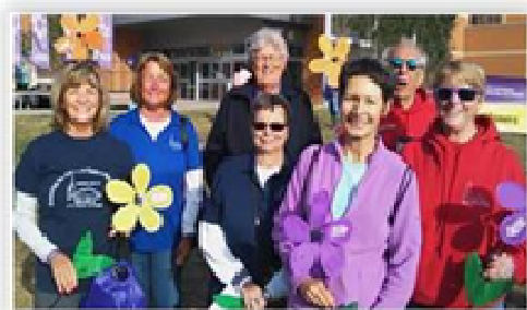
2019 St Paul UCC END ALZ Team