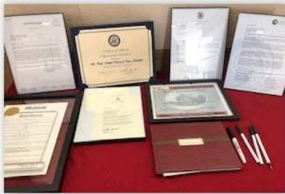
Proclamation and letters to honor our special day.