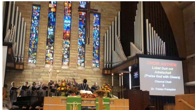
St. Paul Chancel Choir singing a special verse in German