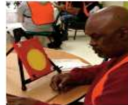
MOLO Village Art Therapy - train

St. Peter's UCC webpage or call 502-583-5544.