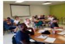
MOLO Village - classroom