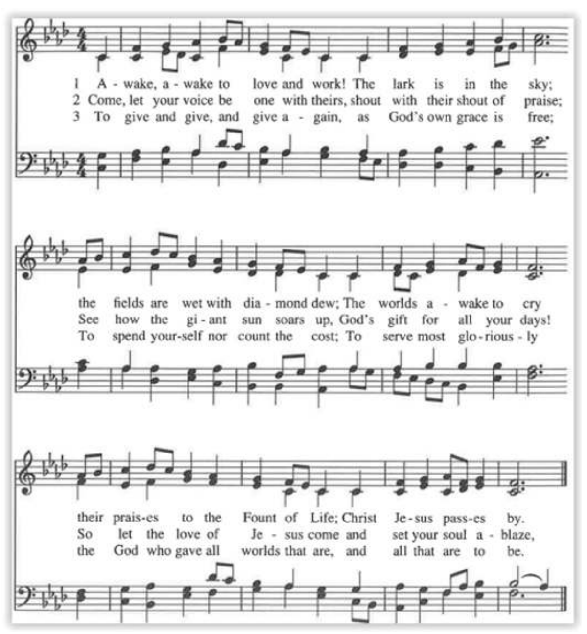
© 2003, ABC Music Co., All rights reserved. OneLicense.net License #A-715913