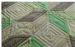
Carpenter's Star: queen size (96 x 106) in shades of seafoam green and gray, hand-pieced & quilted

Activities include: Craft Booths, FOOD, Live Music, Silent Auction, Pontoon Boat & Hay Rides, Kidz Korner, Live Demonstrations and Horse Rides in the arena.